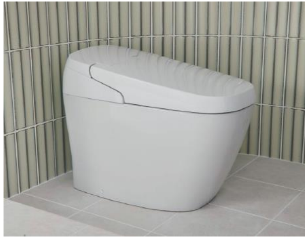
SATIS G Shower Toilet

INAX has also made great efforts in the design of the KBC booth in order to better convey the beauty of Japanese bathroom space. The elegant and clean display colors and the simple, smooth lines of the collection are complemented by a variety of Japanese elements such as tatami and a split shop curtain that highlight the world of Japan.