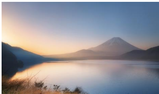
A country blessed with an abundance of water, Japan

See Japan's Rituals of Water come to life in INAX's new line of designs. The exhibition will include displays of INAX's new bathroom designs and upcoming product lines, from baths to toilets, wash basins, faucets and decorative yet functional tiles.